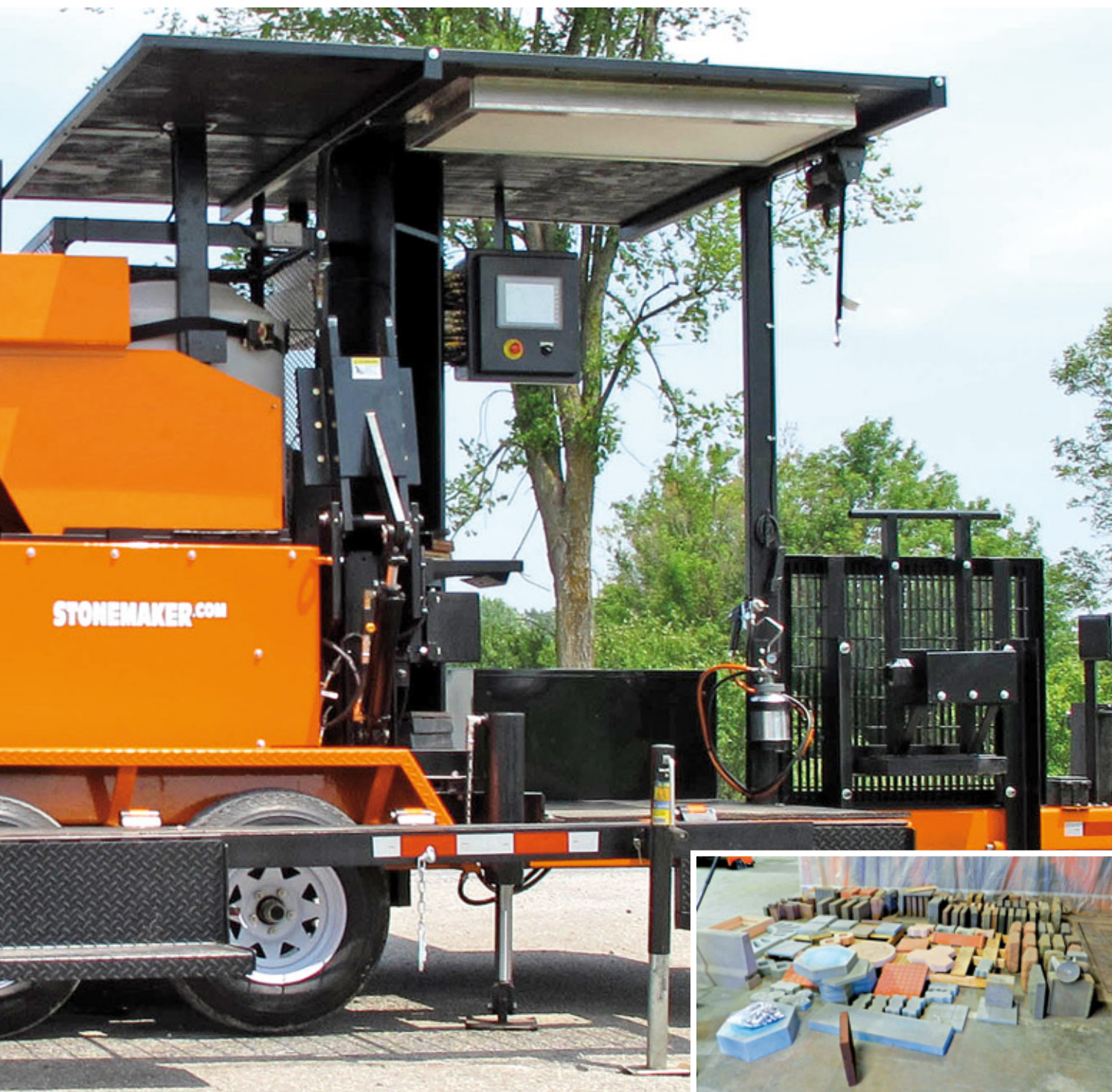
table stone making factory, has the ability to single handedly build a city; from the foundation building blocks all the way to the roof tiles.