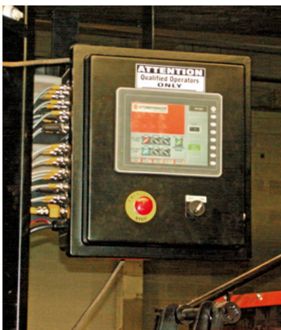
The new control panel allows centralized operating of the machine

Once involved in the project, the trio saw a variety of ways Turck products could be used to improve and streamline the operation of the machine above and